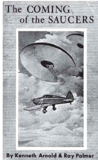
IMAGE / The Coming of the Saucers (1952) One of the first books addressing the first widely-publicized UFO encounter.

American public (and the world) that intelligent life must indeed be “out there somewhere.” It must also be noted here, that while it has never been proven that flying saucers originate from advanced, alien civilizations on other planets, for many, the flying saucer has become the primary symbol representing the concept. Because of this, when an unidentified flying object is seen, or written-about, it has wrongly become a euphemism for “alien life.” People have been brainwashed.